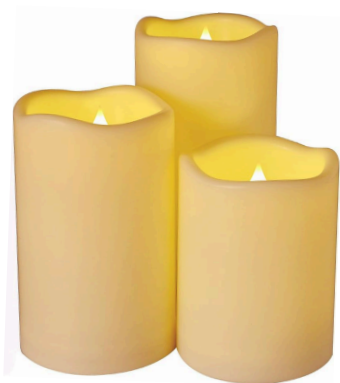
LED Pillar Candles