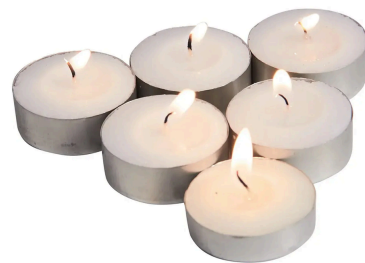
Tea Light Candles