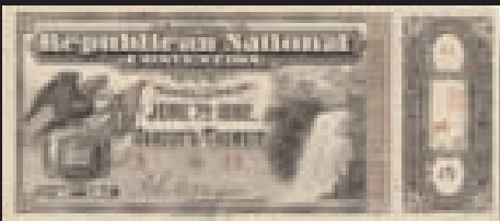
Conventioner Ticket from 1892

The 1892 Republican National Convention was held June 7-10 and resulted in the Presidential nomination of Benjamin Harrison.